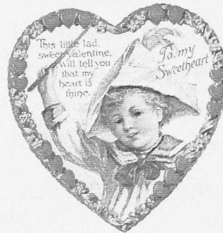
Example of early Valentine, c. 1880

"Good Morrow. 'tis Saint Valentine's Day, All in the morning time, And I a maid at your window, To be your Valentine." -William Shakespeare